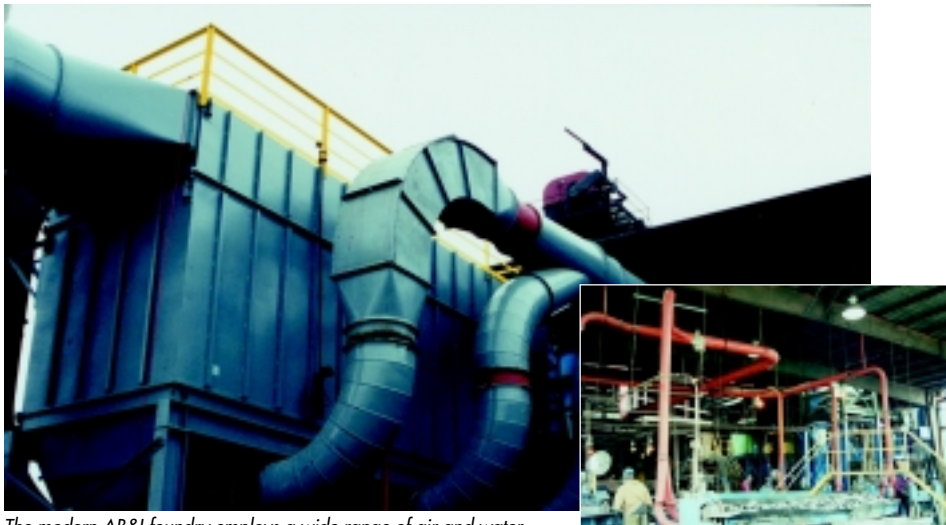
The modern AB&I foundry employs a wide range of air and water systems to minimize environmental impact and to remain in strict compliance with all environmental regulations.

Some groups in the US have been calling for the export of heavy manufacturing out of this country and into the third world, in an effort to minimize the environment impact so-called "dirty" industry has on domestic air and water. Recent studies, however, indicate that moving industry out of America will not mean a cleaner environment and, in fact, could significantly worsen conditions for everybody.