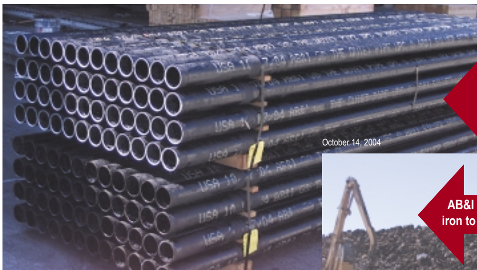
October 14, 2004

All orders for cast iron pipe and fittings can be filled 100% within 24 hours