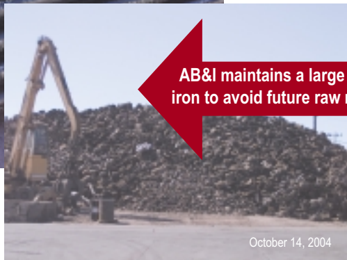
October 14, 2004

All orders for cast iron pipe and fittings can be filled 100% within 24 hours