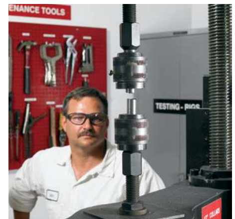
CISPI requires a tensile strength test, as shown, to be conducted every four hours to ensure iron quality.

Some engineers and contractors may wonder why CISPI has such a rigorous quality control inspection program. If they see the ASTM A74 or A888 marked on a piece of pipe, they may automatically assume that someone other than the manufacturer had inspected the material and verified compliance with the standard. That is simply not true. Contrary to popular belief, cast iron soil pipe products are not inspected by ASTM and the ASTM numbers that are typically marked on the products are not even required by the standards. Some importers of foreign-made cast iron pipe and fittings claim that third-party inspections of their plants are required by the code. That is also not the case. In fact, the standard has no requirement for third-party inspections. It clearly states that certification is the manufacturer's responsibility – the entity that poured the iron – and cannot be delegated to a seller or a third-party after the fact. ■