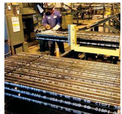
U.S. foundry shows pipe properly marked with country of origin, the name of the manufacturer, and the date it was produced.